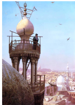
(call of the muezzin)